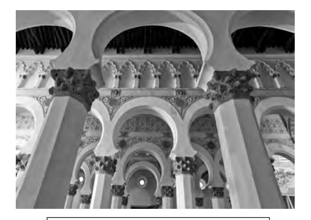
Una sinagoga en Toledo