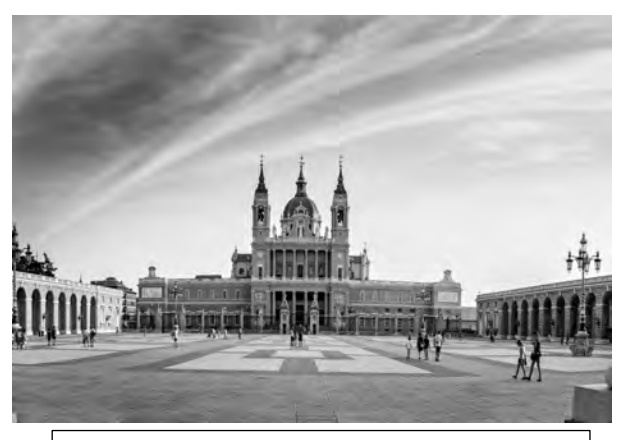
La Catedral en Madrid