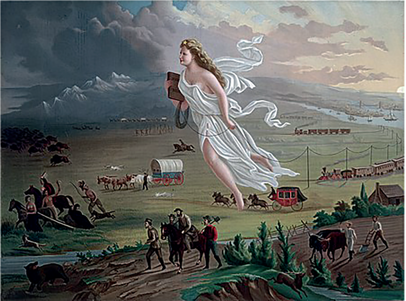
A painting called American Progress , showing the idea of Manifest Destiny, 1872.