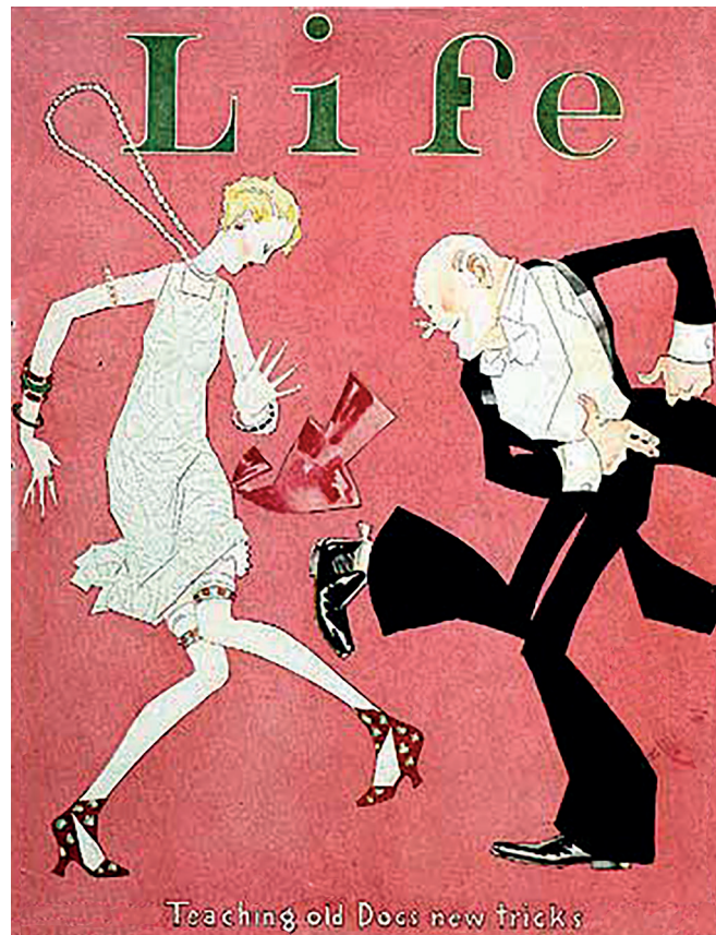
The cover of Life magazine, February 1926. The caption reads "Teaching old Dogs new tricks."