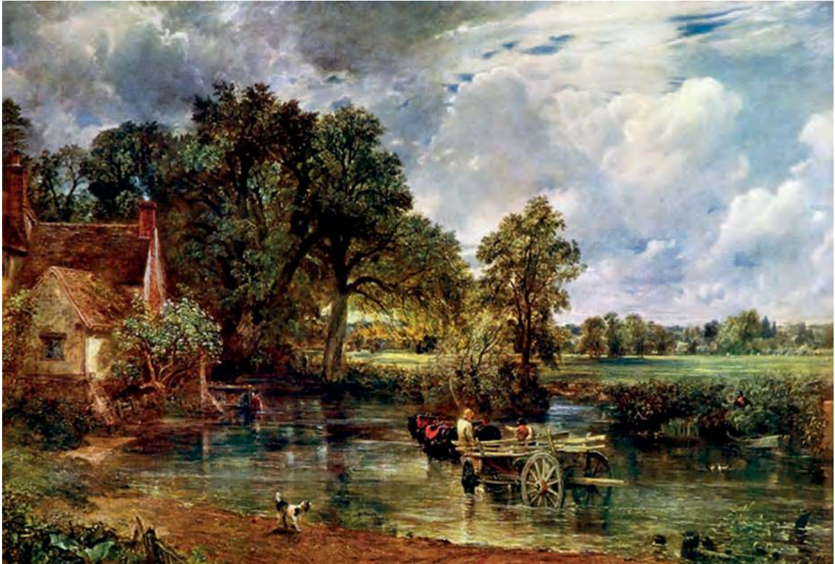
John Constable, The Hay Wain , 1821 (oil on canvas), (130 × 185cm), (National Gallery, London)