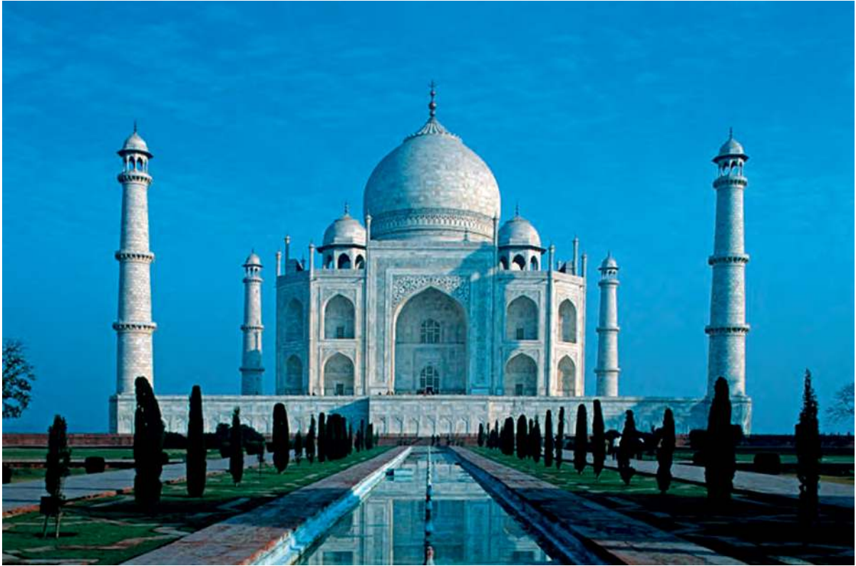
The Taj Mahal, 1632–48, Emperor Shah Jahan, Agra