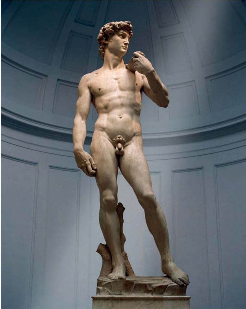
Michelangelo, David , 1501–4 (marble), (h. 4.34 m (incl. base)), (Florence, Galleria dell'Accademia)