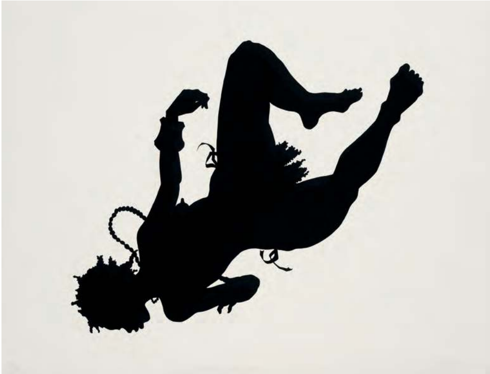
Kara Walker, African/American , 1998. (Linoleum cut, composition) (93 × 106.7 cm) Museum of Modern Art, New York